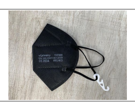
Dark green folding half mask without valve