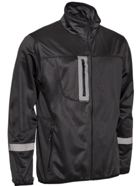
ILLUMINATED REFLECTIVE TAPE